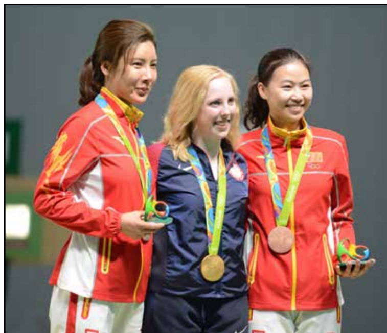
USA shooting athlete Virginia Thrasher (center) won the first gold medal in the 2016 Olympic Games. Photos like this posted in a shooting range almost certainly can inspire young shooters to take pride in shooting and work harder on their own skills.

• Evaluate competition procedures. The best youth sports competitions are governed by national standard rules and are conducted by trained, certified competition officials. Programs that sponsor competitions must make sure they follow the appropriate National Council, CMP, USA Shooting or NRA rulebook. The CMP is