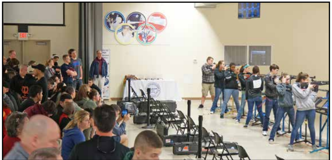
Including finals in junior matches, especially where spectators can be present, is one of the best ways to make youth shooting competitions more like other youth sports.

Boys and girls who participate in most youth sports play in front of audiences. There are bleachers on the sides of the field of play where spectators watch games. Most are parents, relatives and friends, but they are spectators and they cheer enthusiastically. This is an area where youth shooting is not competitive with other youth sports. Most junior shooting ranges barely have enough room for a relay of competitors and one or two Range Officers. Concluding that shooting is not a spectator sport is not acceptable, however. Progressive youth shooting programs must seek ways to encourage spectators and fans.