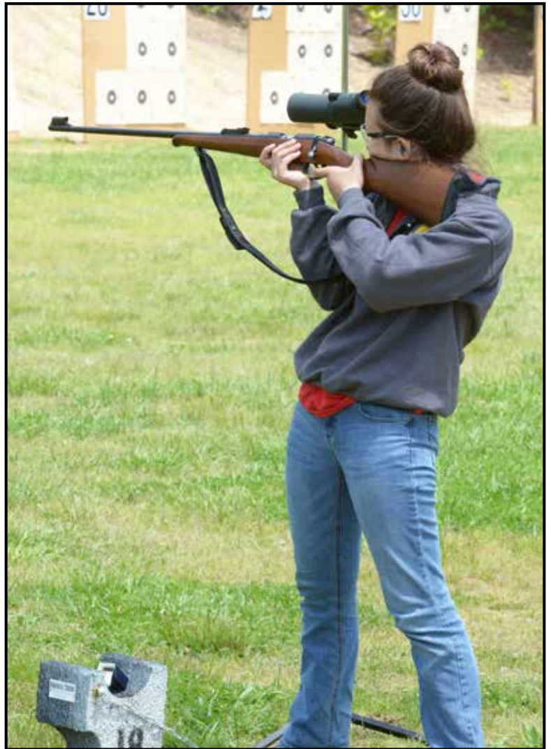
Youth shooting programs should consider offering BB gun or Rimfire Sporter Rifle orientation courses as a way to introduce younger juniors to the sport of shooting.

To do this successfully, it will be necessary to recruit and train new adult volunteers to lead the club pistol program. Start by studying the CMP Guide to Junior Pistol Shooting . Download it from the CMP website at http://thecmp.org/wp-content/uploads/JrPistolGuide.pdf . Pistol coach training is available from USA Shooting and the NRA.