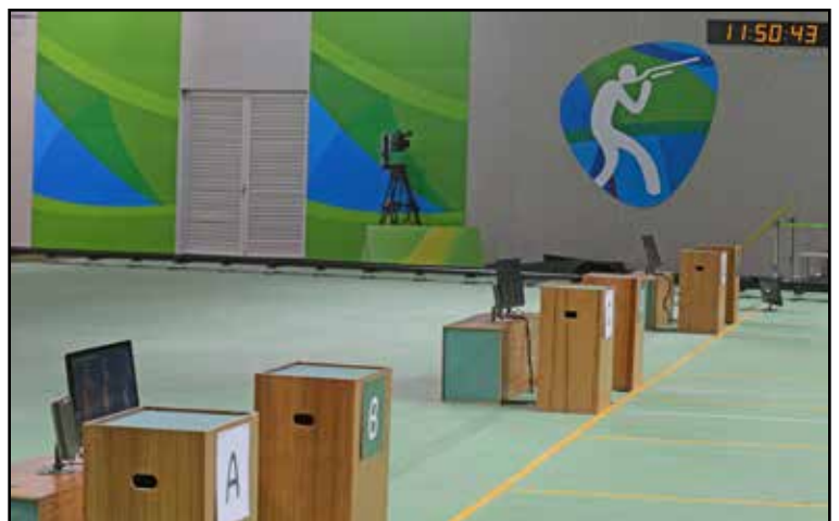
These Olympic "Look" examples in the Rio 2016 Olympic shooting venue illustrate several low cost treatments to make ranges more attractive: 1) a color scheme, 2) a clean, painted floor, 3) dynamic graphics, 4) a modern shooting pictogram and a count-down clock.