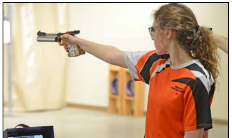
Junior rifle clubs should consider becoming “junior shooting clubs” where youth can choose between rifle or pistol competition opportunities.