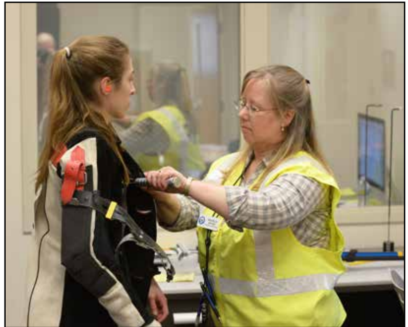
The CMP is introducing a comprehensive new program to train and certify range officers and match officials in 2017. Training is a fundamental step in developing new leaders in youth shooting programs.

There are many steps the leaders of community youth shooting programs can take to pursue an action plan to improve the work they do with young shooters. The ideas and examples in this article can start this process. Ideas that come from other successful youth sports programs can lead to further improvements. Shooting is popular with youth and has the inherent, positive qualities that give its participants outstanding personal growth experiences. Youth shooting programs are capable of competing with other youth sports to earn the loyalties of youth and parents if youth shooting leaders will actively seek ways to make their programs better.