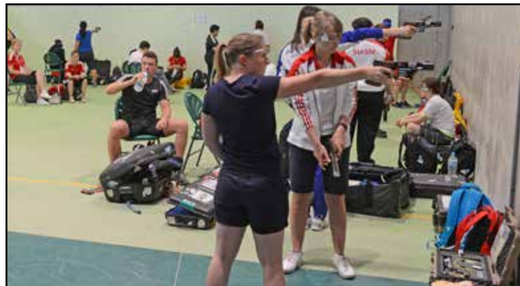
International ranges now must provide warm-up or dry fire areas like this. The photo shows pistol athletes in a World Cup warm-up before a training session. The athletes are doing aiming exercises on a blank wall.

One of the weaknesses in USA junior shooting programs is that the path from starter programs like 4-H BB gun shooting to clubs or schools that sponsor 3-position air rifle or smallbore rifle programs is not integrated. These programs are almost always run by separate organizations. 4-H programs typically start youth at age nine or