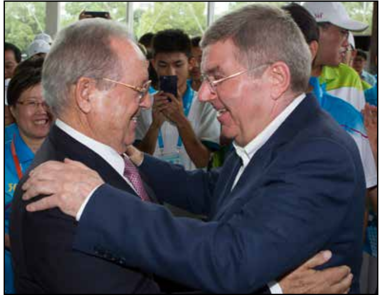
IOC President Dr. Thomas Bach (r.), shown here with ISSF President Olegario Vázquez Raña (l.) said: "Olympic Agenda 2020 underscores the IOC's commitment to gender equality by calling for a 50 percent female participation at the Olympic Games."

One of the best ways to attract more youth and parents to shooting is to make shooting ranges more comfortable and attractive. Too many shooting ranges are still poorly lighted facilities decorated in dreary shades of gray and black. A range improvement program can change that.