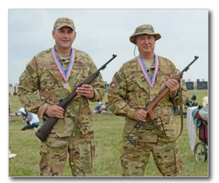
During the CMP Games events, competitors earn gold, silver and bronze CMP Achievement Medals for firing top scores. Thousands of military and civilian competitors visit the historic Camp Perry ranges each National Matches season and boost the area economy.

This year 4,021 individuals participated in 11,385 events including various schools and competitions at the National Matches. CMP National Matches events offer national championship competition in service rifle and service pistol, as well as national level competitions with rimfire sporter smallbore rifles, as-issued military rifles, and air pistols and rifles. Several clinics and camps are also offered during the CMP National Matches.