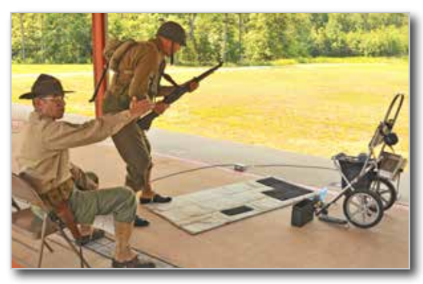
The CMP Talladega Marksmanship Park welcomes guests for several matches and events throughout the year. The park is open daily to the public and offers several training classes each week.

the CMP has expanded this program to the CMP Travel Games. Rifle Small Arms Firing Schools were held in Oklahoma, Vermont, North Carolina, Arizona and Talladega. Over 204 students attended these schools and gained valuable skill and safety training.