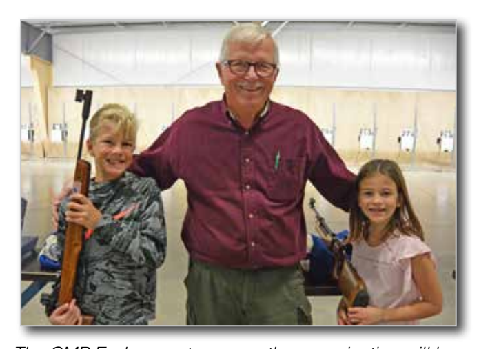
The CMP Endowment ensures the organization will be able to fulfill its mission of marksmanship safety and progress for this generation and those to come.

In FY18, CMP again promoted the CMP Planned Giving program which allows donors to donate cash or name the CMP as the beneficiary of their will, living trust or qualified retirement plan. Donated funds are beneficial to continuing CMP's mission of providing marksmanship opportunities for all.