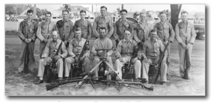
Oklahoma Civilian Rifle Team National Matches, Camp Perry, Ohio - 1939

The law goes on to state that "in carrying out the Civilian Marksmanship Program, the corporation shall give priority to activities that benefit firearms safety, training, and competition for youth and that reach as many youth participants as possible."