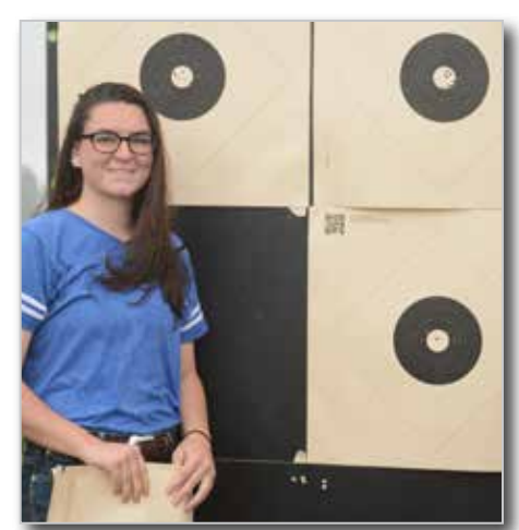
Not only has marksmanship been known to improve confidence, discipline and leadership skills, but it can also promote responsibility, mental discipline and self-control.

materials that are available in print or DVD formats or as on-line downloads through the CMP website This year's distributions included 500,000 printed training and program items plus several hundred DVDs and online downloads.