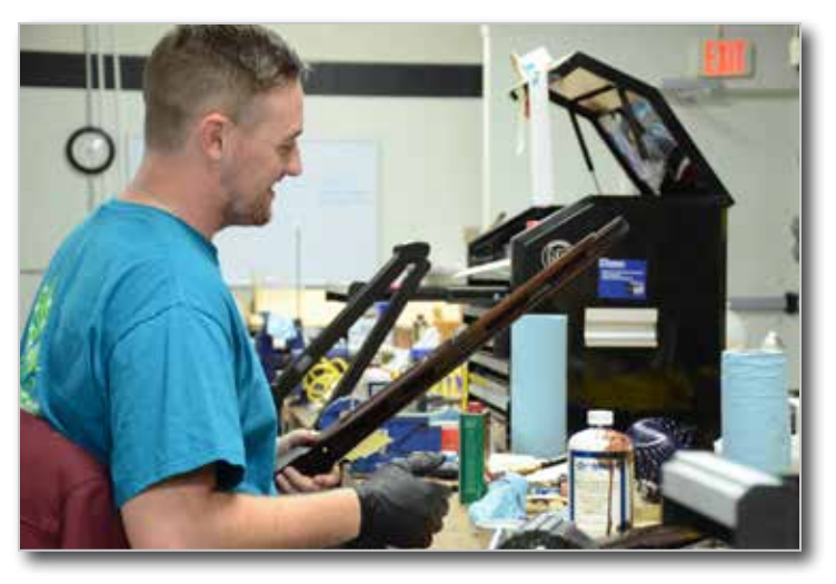
CMP Custom Shop members remain diligent throughout the year with repair work and while conducting several educational rifle classes.

The Corporation recognizes that its primary source of income, the sale of surplus government rifles, will