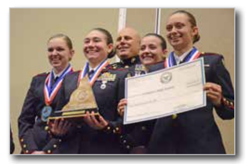
Granbury High School MCJROTC from Texas came out on top of the precision team match.