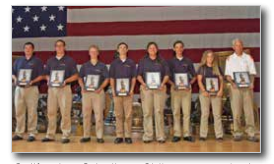
California Grizzlies Shilen earned the coveted Minuteman Trophy as the High Junior Team and set a new National Match record during the National Trophy Team Match.