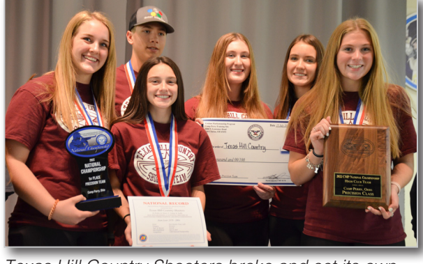
Texas Hill Country Shooters broke and set its own national record twice during the National 3PAR event. They also earned the air rifle High Club title in the 2022 CMP National Air Gun Championship.