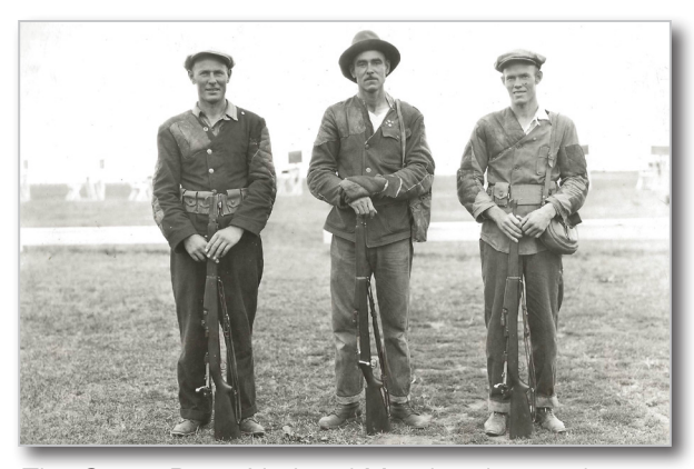
The Camp Perry National Matches have taken place on the same historic grounds since 1907.

The law goes on to state that "in carrying out the Civilian Marksmanship Program, the corporation shall give priority to activities that benefit firearms safety, training, and competition for youth and that reach as many youth participants as possible."