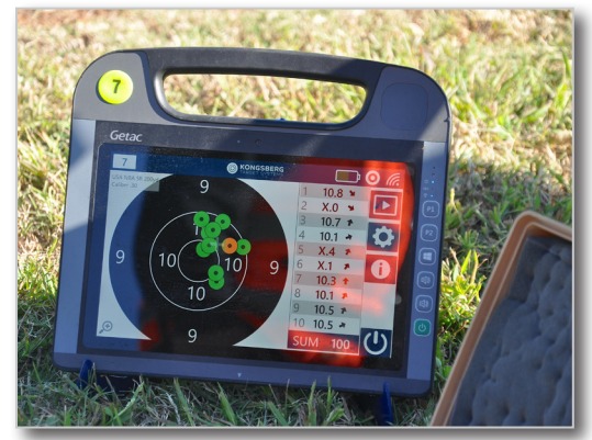
The CMP's electronic target system allows ease for competitors on the highpower range.

Today, the program is popularly recognized as the Civilian Marksmanship Program or CMP. The marksmanship heritage inherited by the CMP in 1996 included the National Matches, Pistol & Rifle Marksmanship 101, and a network of affiliated state associations and clubs. The 1996 legislation (36 USC §40701- 40733) states, in part, that the functions of the CMP are 1) to instruct citizens of the United States in marksmanship, 2) to promote practice and safety in the use of firearms and 3) to conduct competitions in the use of firearms.