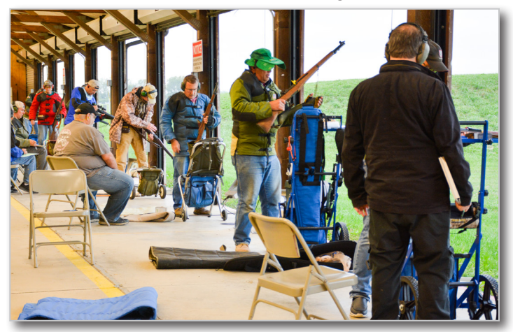
CMP Targets at Petrarca Range is open each week for public use and hosts Games Matches throughout the year. The range is equipped with electronic targets, where shots are displayed on the monitor at each firing point – meaning no need for pit duty.

The CMP sanctioned more than 2,357 matches for approximately 16,207 competitors in 2022. The CMP's sanctioned match program offers