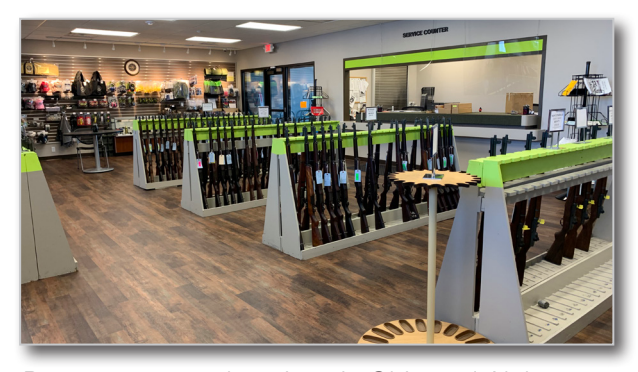
Permanent store locations in Ohio and Alabama allow sales that further support CMP programs.

The CMP operates three successful retail stores that are popular destinations for CMP customers. The first CMP Store opened at Camp Perry, Ohio, in April 2002, the second opened in Anniston, Alabama, in June 2006 and in April 2018, a CMP Store opened at the CMP Talladega Marksmanship Park. While most purchases are made online, the stores give CMP customers an opportunity to personally inspect government surplus rifles before deciding which rifle to purchase. The stores now account for about 7.6% of all CMP sales revenue. The CMP also conducts on-site sales at the CMP Travel Games in Arizona, North Carolina, Vermont and occasionally at other venues.