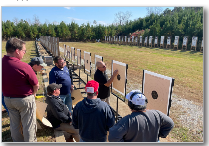
The CMP Talladega Marksmanship Park is "The Home of Marksmanship," where responsible firearm ownership, safety instruction and accuracy training reside inside a beautiful 500-acre facility.

CMP armorers inspect, repair, test fire, install blank firing adapters and ship ceremonial M1 Garand rifles to TACOM at no charge. The CMP has been providing volunteers to inspect and repair ceremonial rifles at veteran organizations since 2003.