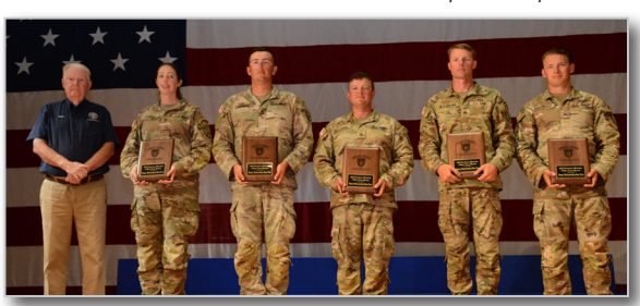
Above: The U.S. Army Marksmanship Unit claimed the 4-Man Team event in CMP National Matches Championship Service Rifle event. Below: Wisconsin Cheddar was the high junior team of the National Trophy Team Rifle Match.