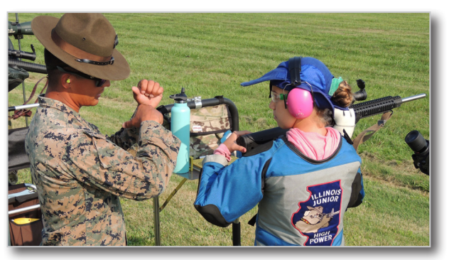
CMP's courses offer hands-on training to individuals for safety and personal instruction for all.

On The Mark continues to provide updates, resources and reports on marksmanship training throughout the country.