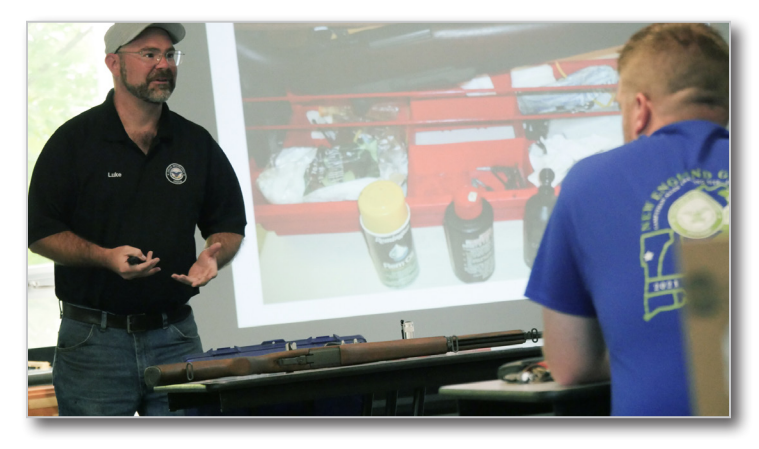
CMP Armorers teach the M1 Maintenance Clinic, which guides guests on the best practices for maintaining the vintage firearm.

The federal law that established the new CMP authorizes the Corporation to sell military surplus .30 and .22 caliber military rifles, parts and ammunition to qualified U.S. citizens for marksmanship. Subsequent law authorized the Department of the Army to transfer certain numbers of M1911 pistols to the CMP on an annual basis.