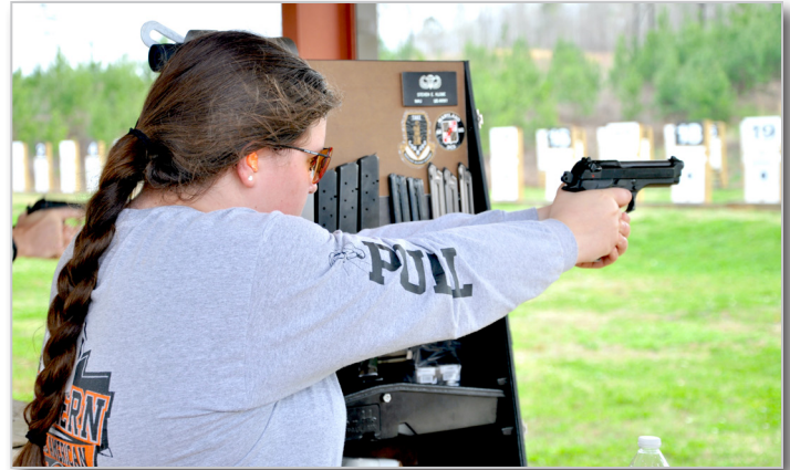
The CMP Spring Classic Matches were held at the CMP Talladega Marksmanship Park in 2021 in lieu of the cancellation of the 2021 CMP Western Games and Highpower Rifle Matches typically held in Phoenix, Arizona. A total of 150 competitors fired in 421 events.