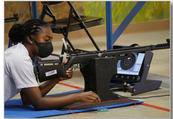
Even through challenging times, CMP has continued to train youth in marksmanship. The Air Force JROTC Leadership Camp was held at Camp Perry in June and attended by over 50 cadets.

Maintaining its prominence as "the Home of Marksmanship," CMP's Talladega Marksmanship Park welcomed visitors and competitors daily to its rifle, pistol and shotgun ranges. The CMP grew its offerings in 2021 by opening additional ranges on the grounds - an Unknown Distance Range and a 3D Archery Range, which features an adjacent practice range. An inaugural Talladega 3D Archery Tournament took place in September 2021, making its mark in the competitive genre. The Park also hosts basic and advanced pistol, rifle and shotgun classes each month, led by certified CMP Instructors, as well as a variety of local, state and national events throughout the year. The facility remains an important venue for marksmanship enthusiasts of all ages, with boundless plans for growth in the future.