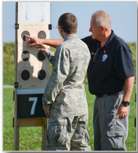
CMP Instructors held a smallbore class in October for the Civil Air Patrol cadets. The instruction focused on safety and basic rifle shooting fundamentals.

The CMP's commitment to youth training persisted in 2021 with a full schedule of Junior Air Rifle Camps during the summer at various locations. These camps offer marksmanship training for both athletes and coaches, led by current NCAA athletes who offer superior personal instruction to each participant. In the fall, the CMP held a Smallbore clinic for neighboring Civil Air Patrol cadets on Camp Perry's Petrarca Range, and groups such as the Boy Scouts and Girl Scouts visited the CMP Competition Centers for their own marksmanship training.