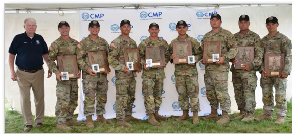
Above: The Army Marksmanship Unit set a new record in the National Trophy Team Match and also overtook the Rattle Battle (NTIT). Below: The California Grizzlies set a new national record as the High Junior team in the NTT.