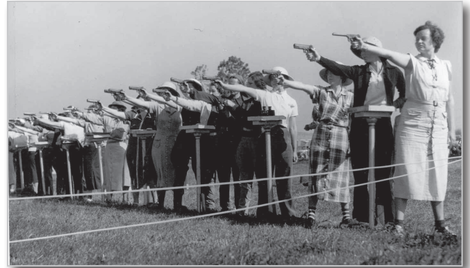
The women's class on the firing line of the Pistol Range at the National Matches, Camp Perry, Ohio, 1937.