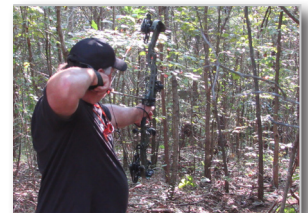
The CMP Talladega Marksmanship Park, "the Home of Marksmanship," continues to be a popular destination for marksmen throughout the U.S. - now offering Rifle, Pistol, Shotgun and Archery.

As a part of our firearms safety and marksmanship mission, with an emphasis on youth, the CMP scheduled Pistol & Rifle Marksmanship 101 courses at various affiliated clubs. Each course includes a classroom portion of instruction and an Excellence-In-Competition (EIC) match. By expanding our presence to these clubs, the CMP has been able to reach a broader audience of citizens interested in the essentials of the sport. To recognize those competitors who display consistent excellence on the firing line, the CMP now issues CMP Classification cards to marksmen at advancing levels.