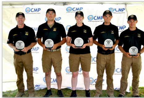
The Army Marksmanship Unit brought home several individual and team titles at the National Long Range events. USAMU fired a 794-39x in the Bataan Memorial Team Match.