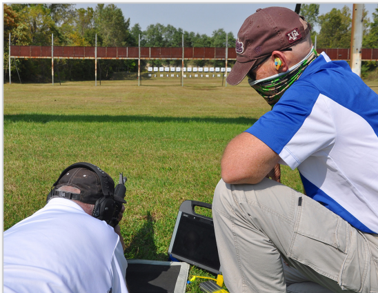
Instructors are able to work one-on-one with students on the firing line to answer questions and ensure safety.

Participation in the CMP's Marksmanship 101 course included 131 students who received introductory safety and marksmanship instruction in Rifle and Pistol. Students learn from the most accomplished military instructors and competitors in the nation. The CMP Marksmanship 101 courses were held in Talladega, Alabama, Butner, North Carolina, Jericho, Vermont, and Oklahoma City, Oklahoma.