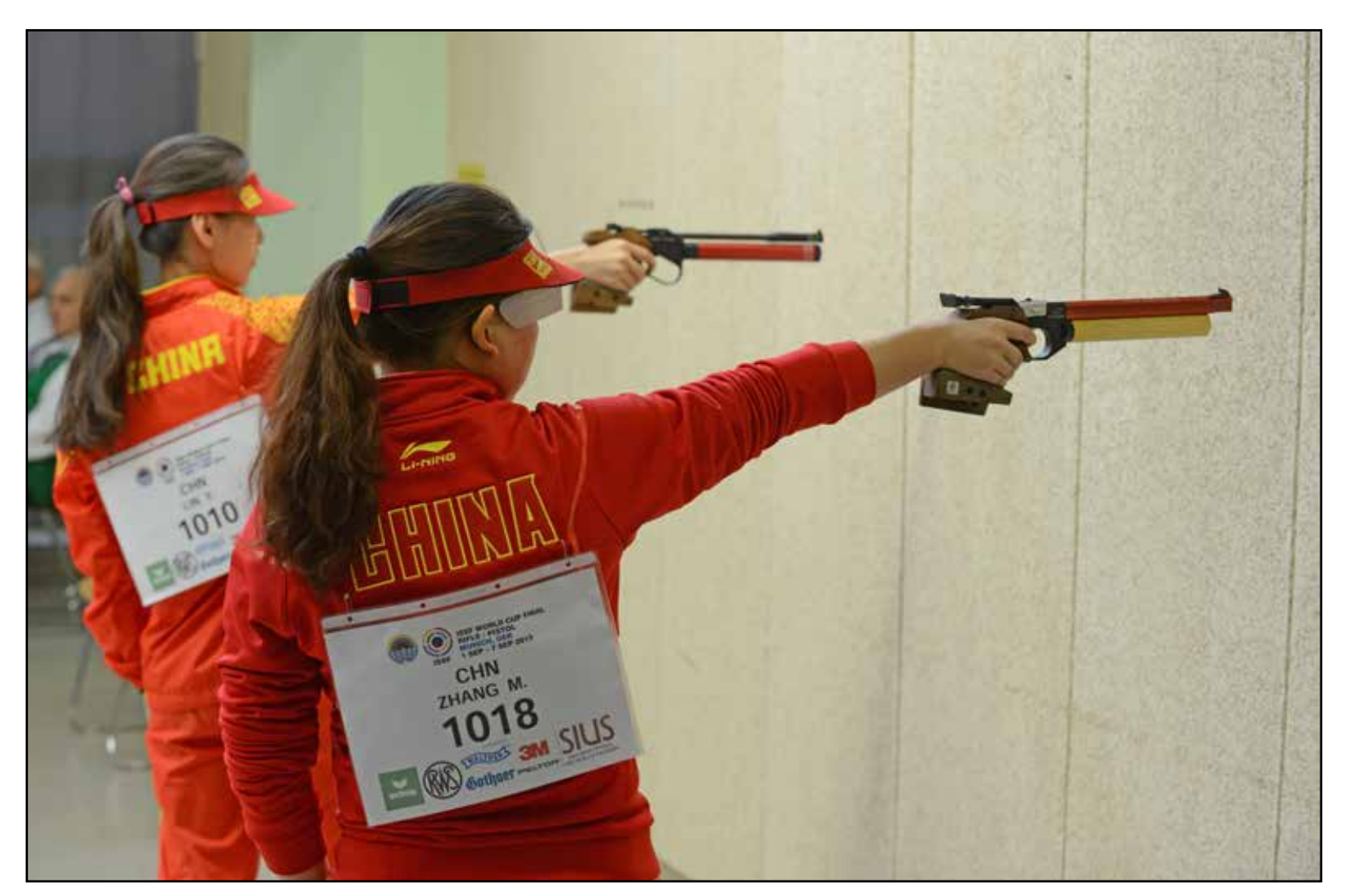
Aiming exercises on blank walls like these two pistol athletes are doing is becoming a favored way for pistol and some rifle athletes to develop improved hold stability. Aiming exercises are also used to warm up before training or competitions.

• Aiming Exercises (holding drills). Aiming exercises are done by aiming at blank targets or a blank wall. Athletes use aiming exercises and holding drills to improve control of their body and reduce sight picture (hold) movements. Many pistol athletes use aiming exercises to enhance sight alignment stability. Rifle athletes may do aiming exercises as a way to enhance their inner position performances. They do this by focusing attention on how the muscles and balancing mechanisms feel while they strive to stabilize their bodies.