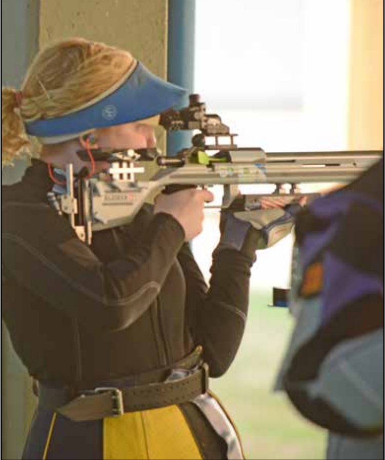
Different specialized training methods help athletes analyze and perfect how their bodies perform while trying to improve hold stability. Here, Olympic gold medalist Ginny Thrasher, USA, warms up before 50m range training by doing holding drills without her shooting jacket.