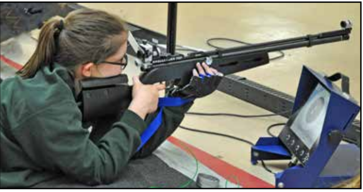
Training requirements for beginning and intermediate athletes are very different from the training requirements for advanced and elite athletes.

• Intermediate – Mastering Skills Phase. In this phase, athletes focus on making correct repetitions of the skills they learned as beginners. Here the coach's role shifts from giving instruction to observing, answering questions and making necessary corrections. As shooters become comfortable with their firing positions and shot technique performances, training volume should increase. An athlete in this phase can handle one to two hours of shooting a day, three to five days a week. Coaches and athletes can evaluate their training loads by determining whether they are putting full concentration and effort into performing each shot correctly.