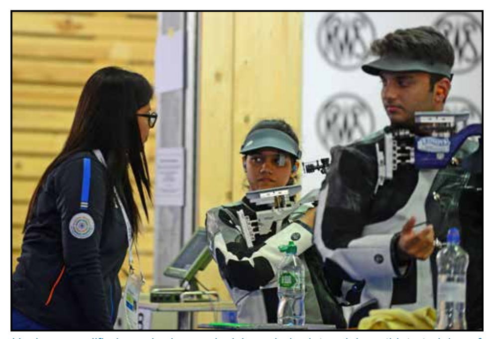
Having a qualified coach plays a decisive role in determining athlete training effectiveness. Here, a coach of India's National Junior Team intervenes with her athletes during a 2019 ISSF Junior World Cup Mixed Team Final.

• Group Environment . One aspect of the training environment that can determine how athletes train is what might be called the group environment ( Gesellschaft in German). Some school teams and clubs consistently produce outstanding junior shooters because their leaders expect excellence from team members and team members expect excellence from each other. A program that approaches its practices as regular sports team practices will facilitate better training. Champion Shooting athlete or marksmanship history images that are displayed at a range can inspire stronger motivations. Programs that inform their athletes about winning scores, especially at the international level, will raise their athletes' mental standards.