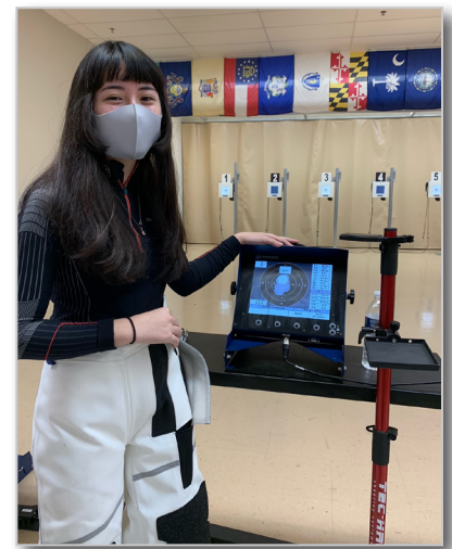
The CMP continued to host a number of matches and events in 2020, in accordance to social distancing and other safety precautions.

This CMP 2020 Annual Report provides summary data on CMP programs and activities that took place in FY20.