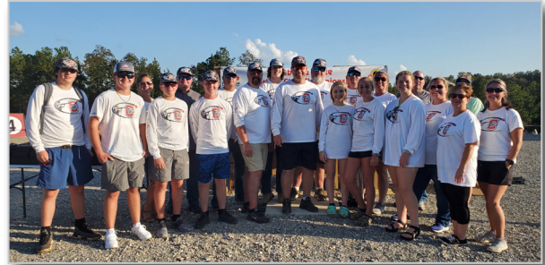
The CMP Talladega Marksmanship Park, the Home of Marksmanship, regularly welcomes a variety of large groups and teams throughout the year.

to 344,817 subscribers. Electronic communications are the CMP's primary means of communication with program participants.