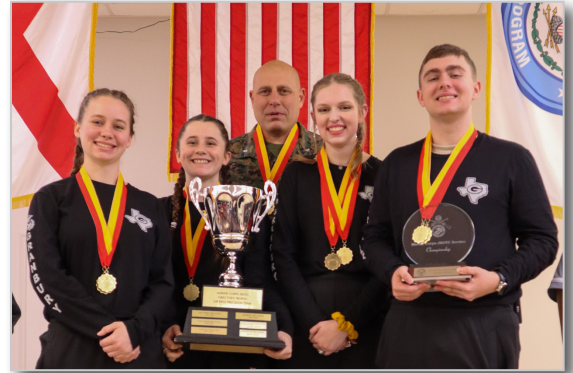
Granbury HS MCJROTC, of Texas, finished first in the Precision Air Rifle JROTC Regional competition with a score of 4692-320x.