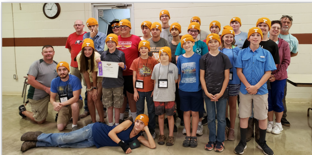
CMP 4-H funds were used to help operate the Tennessee 4-H Target Smart Camp. This camp helps youth to develop firearms safety, responsibility and life skills.

The CMP posted over 93 new feature articles and provided periodic (usually bi-weekly) issues of this electronic online newsletter to 112,148 email subscribers. CMP Sales updates are also provided