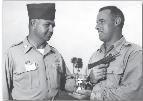
CMP leads marksmanship organizations in recognizing top marksmen and women for outstanding achievements.

The law goes on to state that "in carrying out the Civilian Marksmanship Program, the corporation shall give priority to activities that benefit firearms safety, training, and competition for youth and that reach as many youth participants as possible."