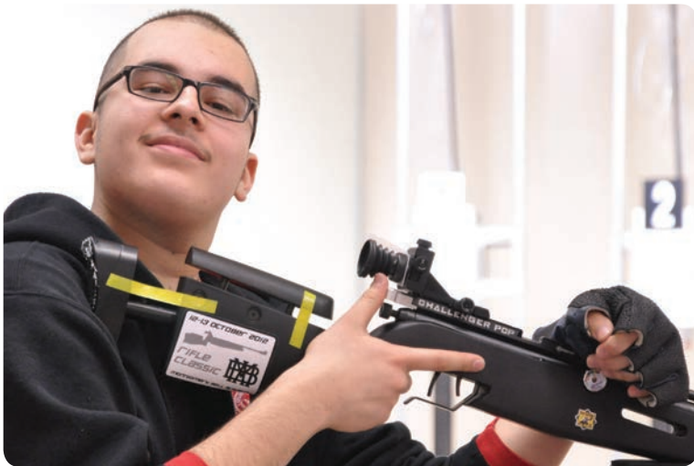
The shooters took time to smile as they competed at the prestigious event.