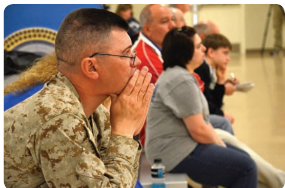
Coaches and spectators watched intently as the shooters put all of their hard work to the test over the two-day event.