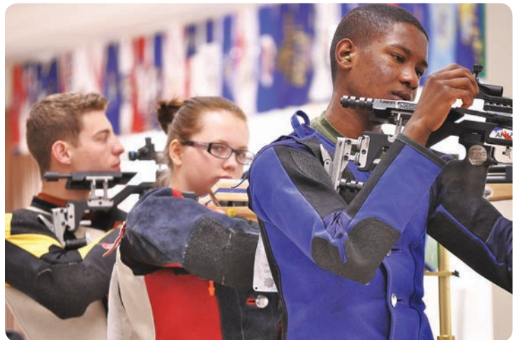
Many talented shooters attended the competition, recording some of the highest scores in the event's existence and breaking several records.