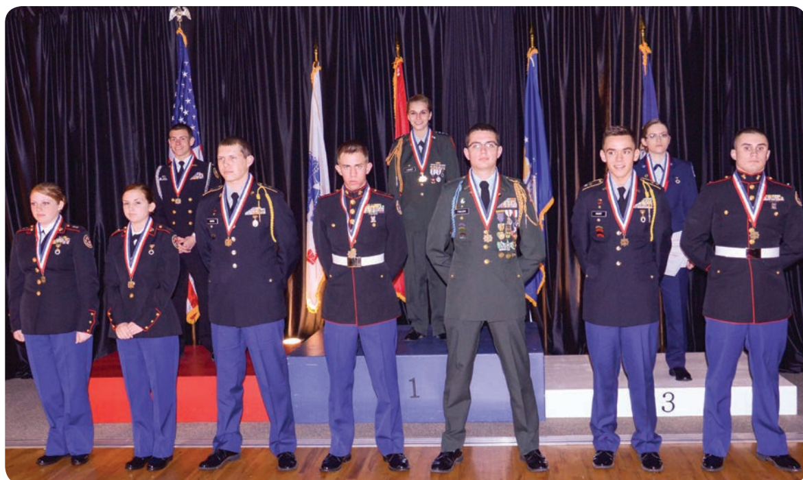
The top 10 individual precision air rifle place finishers were recognized as a group at the 2013 JROTC National Air Rifle Championship awards banquet. Gold, silver and bronze winners remain assembled on the podium.