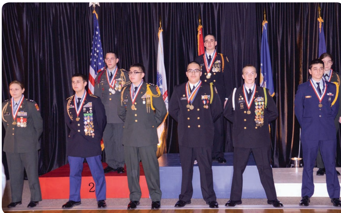
The top 10 individual sporter air rifle place finishers were recognized as a group at the 2013 JROTC National Air Rifle Championship awards banquet. Gold, silver and bronze winners remain assembled on the podium.