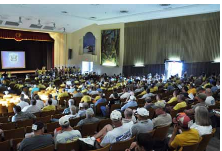
More than 380 students attended this year's SAFS Pistol school. Here attendees await instruction at Hough Auditorium.