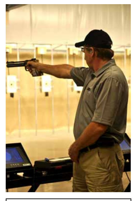
The CMP Marksmanship Centers in Anniston, Alabama, and Port Clinton, Ohio, are open for Monthly Matches and Open Public Shooting.

The CMP also holds monthly Air Pistol Events at the CMP Marksmanship Centers in Anniston, Alabama and Port Clinton, Ohio. Dates for upcoming monthly matches are 17 September, 8 October and 19 November. For more information, please visit <a href="http://www.odcmp.com/3P/MonthlyMatches.htm">http://www.odcmp.com/3P/MonthlyMatches.htm</a>. The CMP Marksmanship Centers are also open September through May for Open Public Shooting on Tuesday and Thursday evenings.