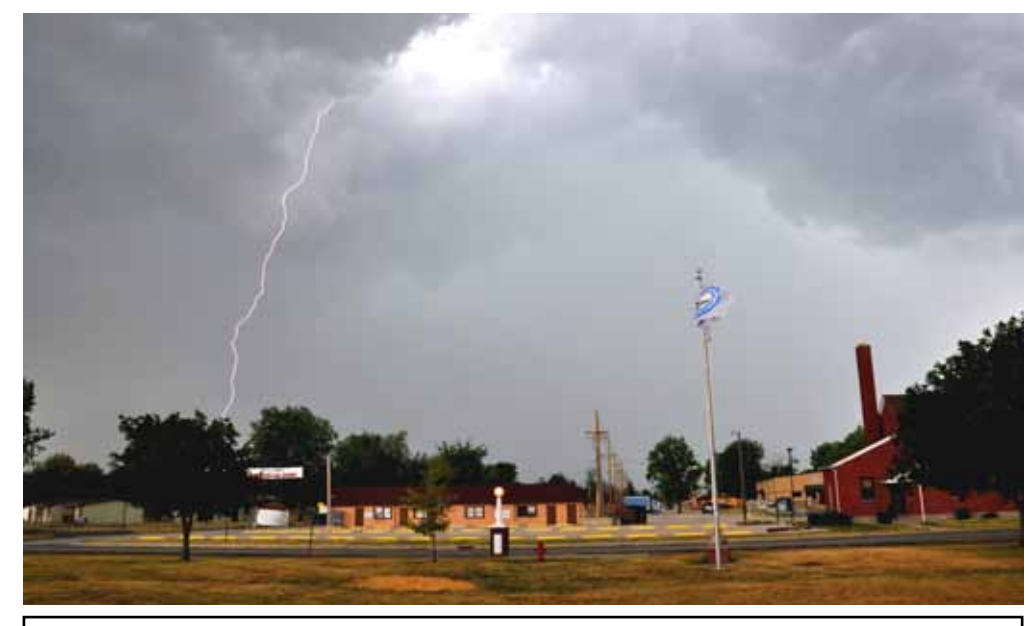
Lightning strikes are a part of life at Camp Perry in the summertime. Unfortunately, inclement weather forced the cancellation of most shooting at the 2011 Small Arms Firing School for Pistol.

The CMP is refunding two-thirds of participation fees ($30 of the original $45 fee) to all SAFS Basic Pistol attendees regardless of whether they received range time or not. All Basic participants will separately receive a certificate of attendance by mail in addition to the t-shirt, National Matches lapel pin and instruction booklet they received at registration.