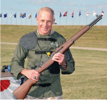
BG Spiese choose an M1 Garand to fire the ceremonial "First Shot" of the 2009 National Matches.

CAMP PERRY, OHIO - The 2009 National Matches First Shot Ceremony on 13 July featured the dedication of the new Camp Perry Memorial Plaza, inspiring comments by featured speaker U.S. Marine Corps Brigadier General Melvin G. Spiese, a dramatic flyover by an Ohio National Guard Blackhawk helicopter and the delivery of the ceremonial American Flag by three Ohio National Guard 19th Special Forces paratroopers.