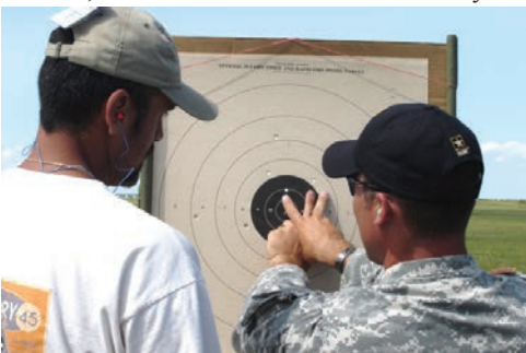
Part of the attraction of the Small Arms Firing School is the opportunity for shooter to receive hands-on instruction from the top military shooters in the country. Participants sit through a half-day of classroom instruction, which is followed by a practice session and EIC match on the range.