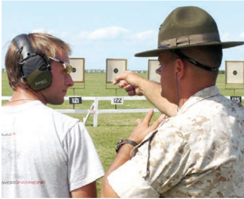
Students were instructed on the range as well as in the classroom. After the two instructional sessions, students fired an M9 EIC Match.

CAMP PERRY, OHIO – There is a growing trend among U.S. shooting organizations to increase participation in competitive pistol shooting to both to educate the public about proper firearms safety and proficiency, and to strengthen competition numbers.