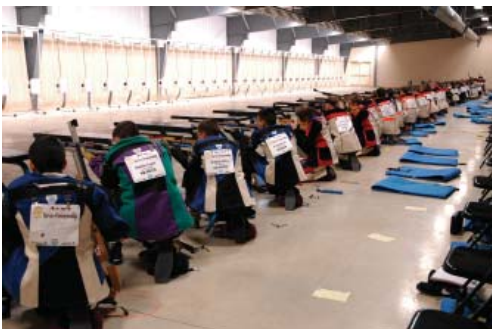
215 Cadets attended the Army JROTC National Air Rifle Championship, representing 65 different schools from the Continental USA, Alaska and Department of Defense Schools in Europe. This was the first of three JROTC Championships slated to take place at the Camp Perry Marksmanship Center in the month of February.

Congratulations to all the Cadets and thank you to all the JROTC instructors, volunteers, parents and supporters for making this event a success. For a direct link to final results go to, http://clubs.odcmp.com/cgi-bin/report_matchResult.cgi?matchID=4376 , to see photos from the event go to, http://www.odcmp.com/Photos/09/ArmyAR-Champ/index.htm .