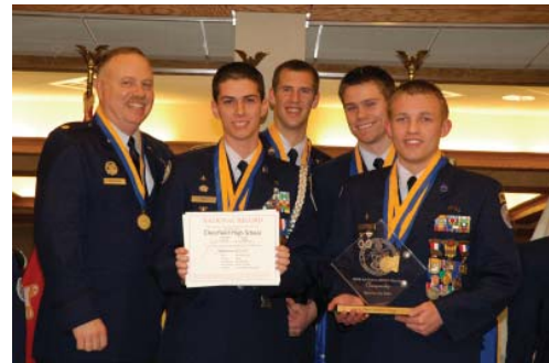
Clearfield HS from Clearfield, UT was the top Air Force JROTC sporter team with a score of 4236, a new Air Force JROTC National Record. This was the second year in a row that Clearfield High School has claimed this title.