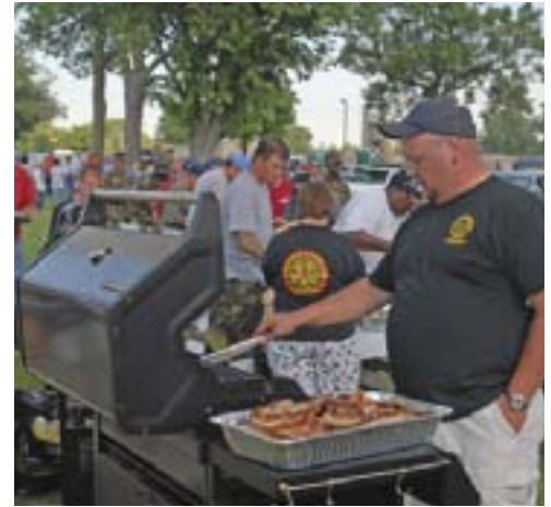
CMP staff members cooked brats and hot dogs for all competitors at the end of the match.

Complete results for the Rimfire Sporter Match are posted on the CMP web site at http://clubs.odcmp.com/cgi-bin/report_matchResult.cgi?matchID=1448 and pictures can be viewed at http://www.odcmp.com/Photos/06/Rimfire/index.htm . Anyone interested in learning more about Rimfire Sporter is invited to check out the CMP Guide to Rimfire Sporter that can be downloaded from the CMP web site at http://www.odcmp.com/Competitions/rimfire.pdf .