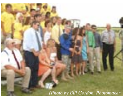
LTG H Steven Blum poses with juniors who work on the National Matches range crew and whose countless hours of hard work are necessary to set up the ranges for the matches.

LTG Blum shot the traditional First Shot with an M1 Garand. The M1 Garand was the single most significant small arms development in the history of modern warfare during WWII. After the target that was 500 yards downrange exploded, General Blum posed for pictures with each of the military teams that were in attendance. To view additional photos from the First Shot Ceremony, click on http://www.odcmp.com/Photos/06/First_Shot_Ceremony/index.htm .