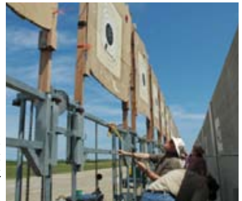
The reconstructed Viale Pits got plenty of use during highpower week at the National Matches. The hundred year old pits were completely rebuilt and new target frames were installed.

The ceremony marked the beginning of the National Matches highpower phase, with the EIC M16 Match being the first event held on the reconstructed range. For photos of the reconstruction project visit http://www.odcmp.com/Photos/05/Viale_Range/index.htm , for photos of the completed pits and Rededication Ceremony visit http://www.odcmp.com/Photos/06/Viale_Range/index.htm .