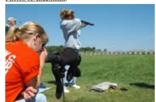
The 9th Annual John C. Garand Match drew record numbers with 1315 competitors. Attendance was high for all the CMP Games Events with record numbers for each match.