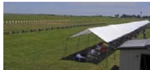
The 5th National Rimfire Sporter Match took place on a temporary 60-firing point covered range that was set up by CMP staff. The benches between the targets and firing line are for standing position firing at 25 yards. Prone and sitting position firing was done under the cover at 50 yards distance.