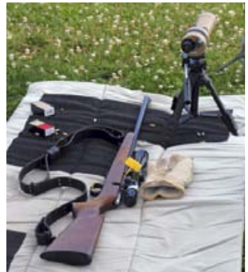
The only equipment needed to compete in Rimfire Sporter is a sporter-class .22 cal. rimfire rifle, a sling, ordinary glove, shooting mat, scope and ammo. Nothing else is required to be competitive.