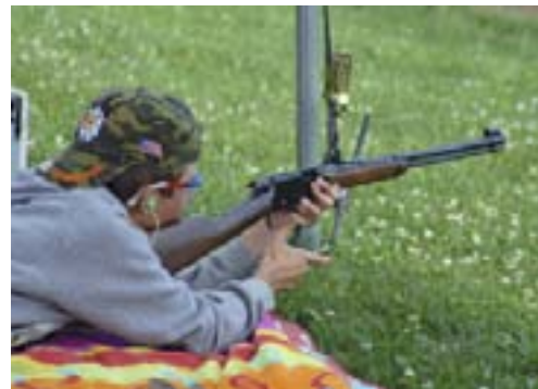
Rimfire sporter attracts lots of juniors who are able to compete successfully with a variety of lever, bolt, pump and semi-auto rifles.