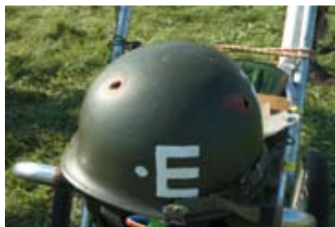
Several competitors dressed in period military uniforms for the CMP Games Events. The helmet pictured here represents the famed E Company, Army Air-Bourne Unit from WWII.

For complete results from any of these Matches please visit CMP's website at http://clubs.odcmp.com/cgi-bin/report_matchResult.cgi?matchID=1409 , for photos from the events visit http://www.odcmp.com/Photos/05/Index.htm .