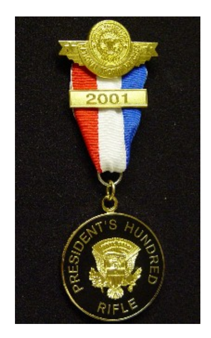
CMP President's Medal