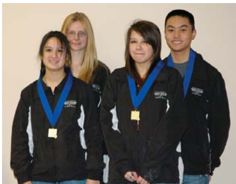
Zion Benton HS of Zion, IL was the top Sporter Team at the 2009 Camp Perry Open. Full coverage of the event can be found.....Page 18