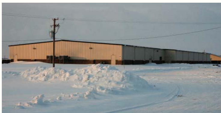
CMP's New Competition Center at Camp Perry allowed plenty of room for growth in the 2009 Camp Perry Open program. Located right off of Lake Erie, the 80-point electronic air rifle range provides a good refuge from the snowy winter weather.

CMP's new 80-point electronic air gun range was a major contributing factor to the success of the expanded Camp Perry Open. Shooters were willing to brave temperatures as low as -13°F and snowy weather to make the trip. Another attractive feature of the match was CMP's efforts to minimize