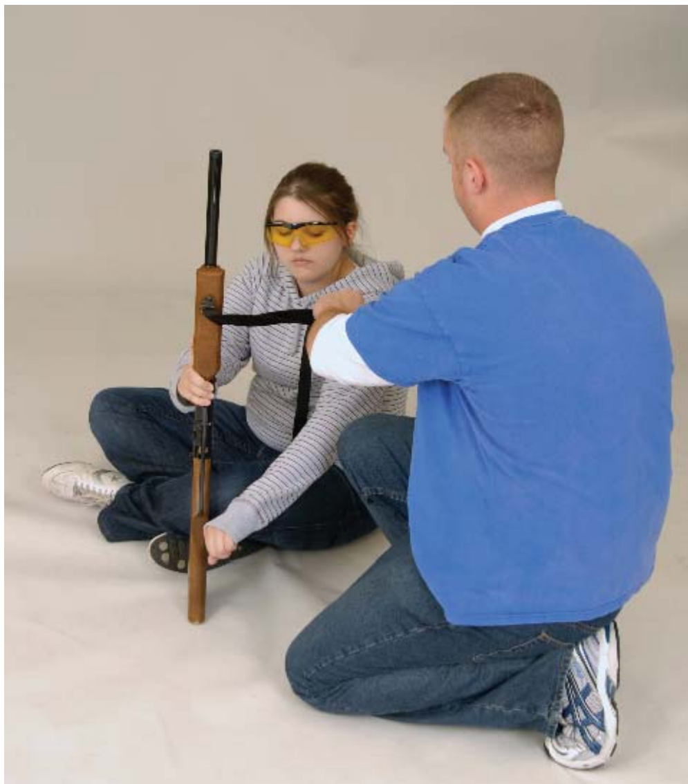
Coaches face unique challenges in getting younger shooters into stable sitting positions. Success depends on following the correct steps for selecting the right position and then building it into a stable position.

When choosing between cross-legged and cross-ankled sitting, the right choice for each shooter depends upon how their bodies are configured,