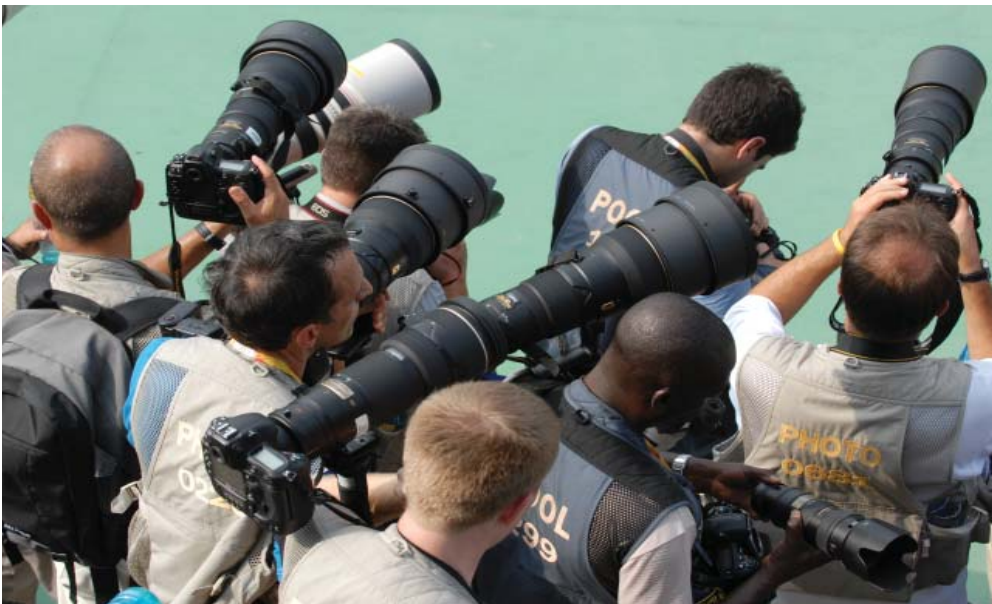
The world press on hand at the Finals Hall at the Beijing Shooting complex for the 2008 Olympics. Shooting on the world's largest athletic stage is a goal for many athletes, and now the focus has shifted to the 2012 London Olympics.

The Olympic Games are part of a cycle of international events that take place every four years. This cycle is referred to as the Olympic Quadrennial. Each quad begins at the end of the Summer Olympic Games and is a four-cycle of major international matches that end with the next Summer Olympic Games. For the USA Shooting