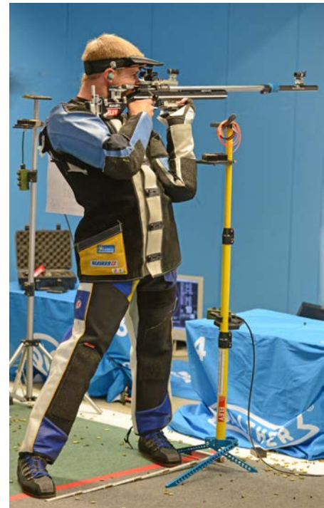
Encouraging young athletes to learn about champions' techniques and scores helps them develop higher mental standards. The athlete is Matt Emmons, USA, multiple Olympic and World Championship medalist.

One of the most important mental constructs that an aspiring shooter can acquire is a clear understanding of how marksmanship skill is developed. The essential skills in shooting are motor control skills. Getting uncoordinated muscles to work together to stabilize the shooting positions is a motor control skill. Teaching the brain to coordinate sight