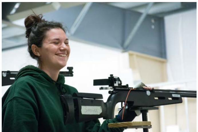
There is a time to celebrate great scores—after the last shot is fired and the gun is cleared!

EMOTIONAL CONTROL. One of the most destructive responses to bad shots or poor scores is acting out. Profanity, angry outbursts or throwing things should never be tolerated on the shooting range. More importantly, young athletes must be taught that controlling their emotions is the most constructive way to deal with frustrations and setbacks. Tell them their reactions after a bad shot should be no different than their reactions after a good shot. There is, of course, a time to celebrate good scores, but that should come after the last shot is fired and the gun is cleared.