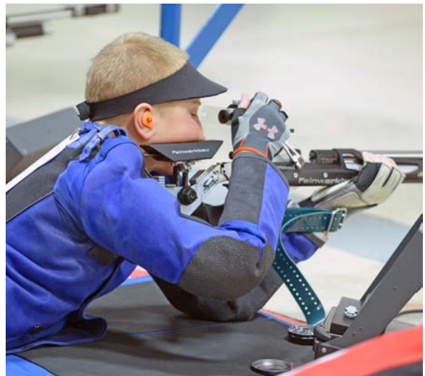
The most elementary form of post-shot analysis and correction is to decide that the shot was off-call and to make the required sight adjustment.

SHOOTERS DIARY OR JOURNAL. Analysis is a fundamental mental performance skill that every serious shooting athlete should master. The most practical tool for doing this is to keep a diary or journal record of every shooting training and competition session. Making regular journal or diary entries teaches the athlete to think about their shooting performances. Journal entries should note things done right because that reinforces correct shooting performance. Journal entries should also note any problems or errors that need to be corrected through positive performance measures in the next shooting session.