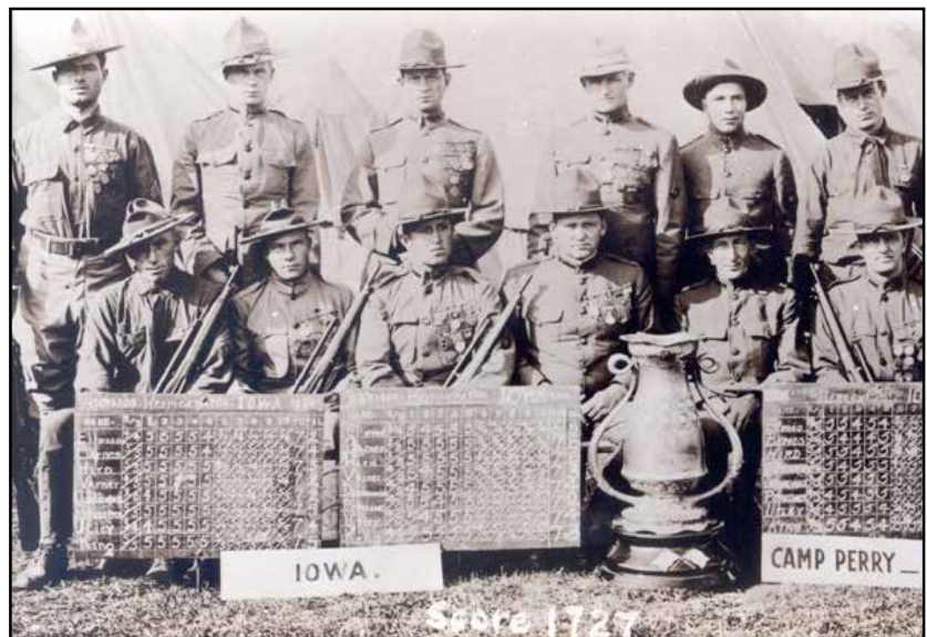
A winning Iowa Rifle team at the 1913 Camp Perry Rifle Matches. They are shown with their trophy and scoreboards. The rifles are 1903 Springfields with Winchester A5 scopes.

From its inception in the early part of the 20 th Century, a major function of the Civilian Marksmanship Program was to conduct the Annual “National Matches” that have become its tradition. In addition to competitions for a growing collection of “National Trophies,” the matches included Small Arms Firing Schools that taught thousands