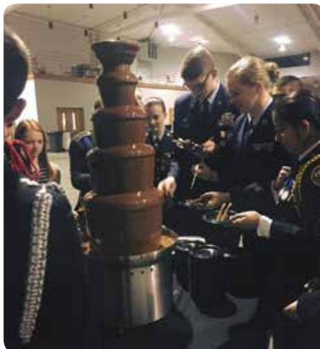
JROTC cadets were treated to a chocolate fountain at the awards banquet.