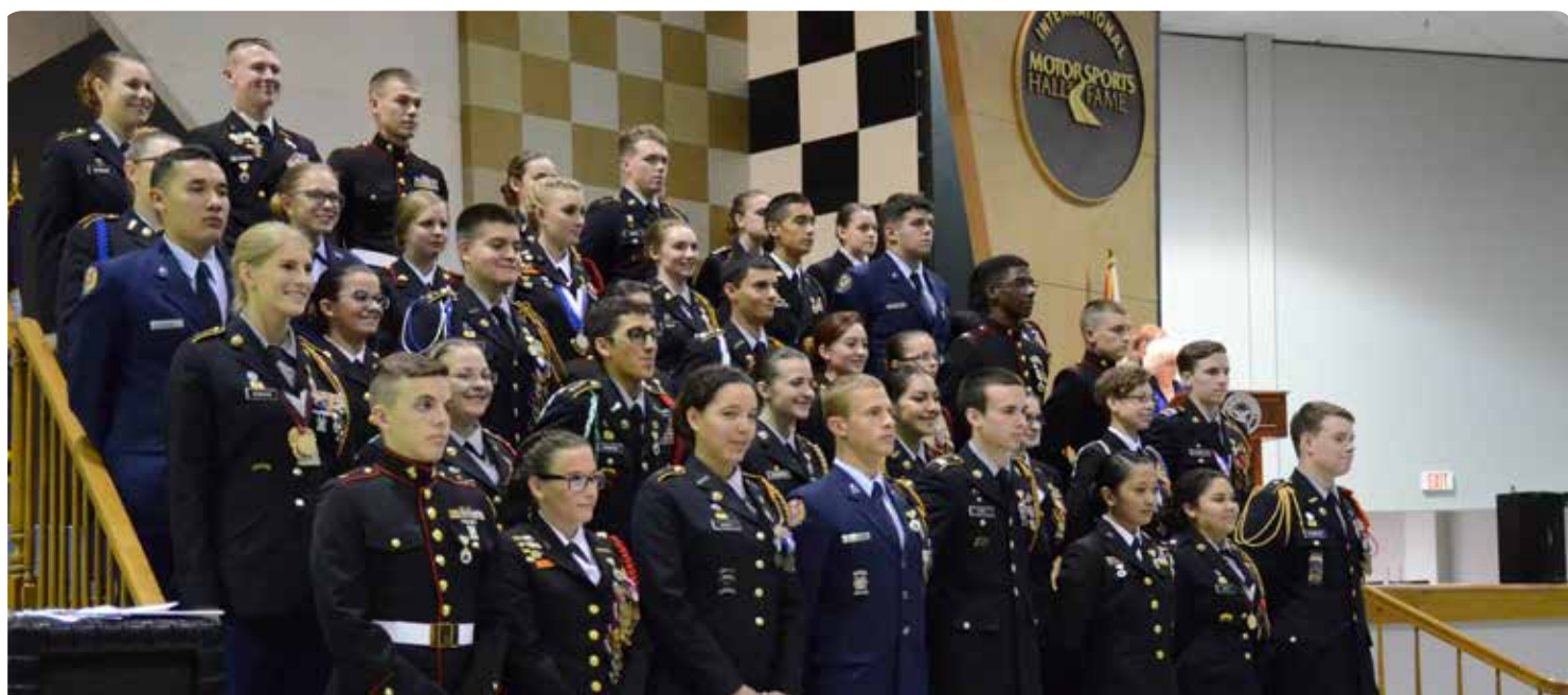
Over 35 talented juniors received their Distinguished Air Rifle badges at the awards banquet.

For more information on the JROTC Championships, visit http://thecmp.org/air/jrotc-air-rifle-national-championship/ .