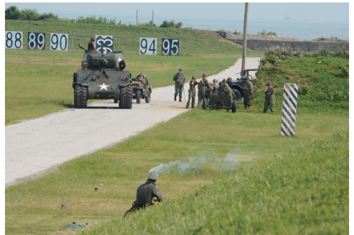
A battle between the Americans and the Germans broke out during the ceremony. Of course, the Americans came out on top.