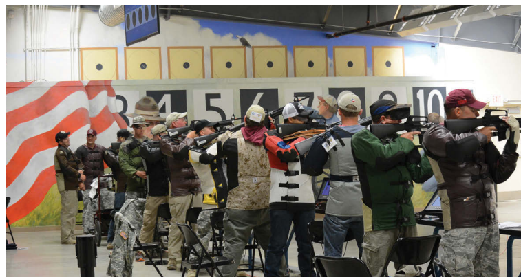
This year, there were over 100 more entries signed up for the AiR 15 Challenge than last year’s match – proving its growing popularity during the National Matches.

the number of entries. The next seven closest competitors will also receive money for their efforts.