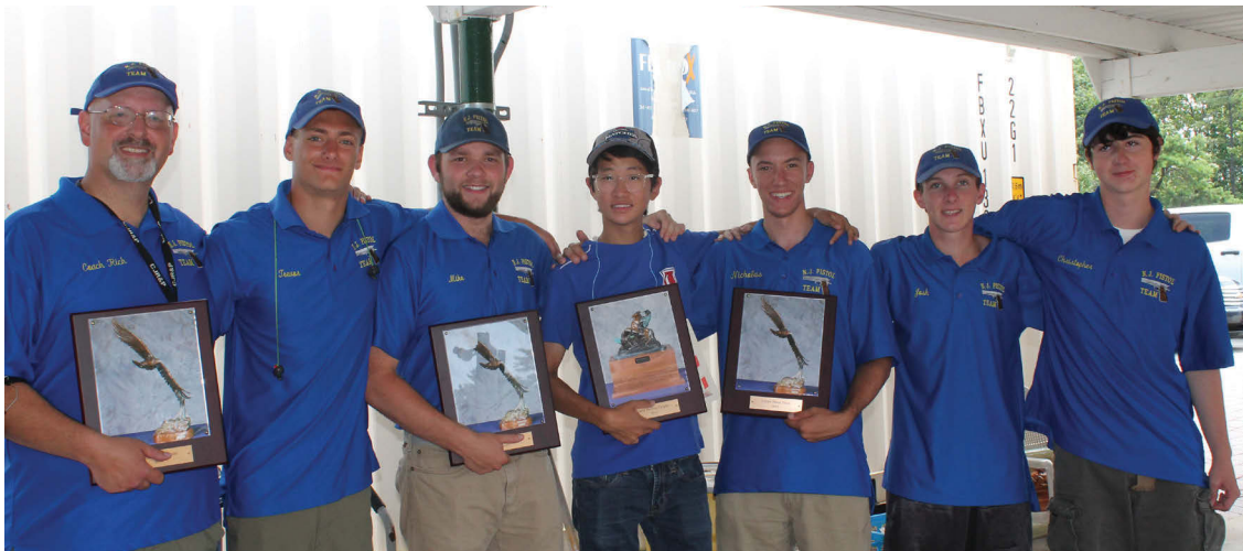
New Jersey Junior Pistol Team