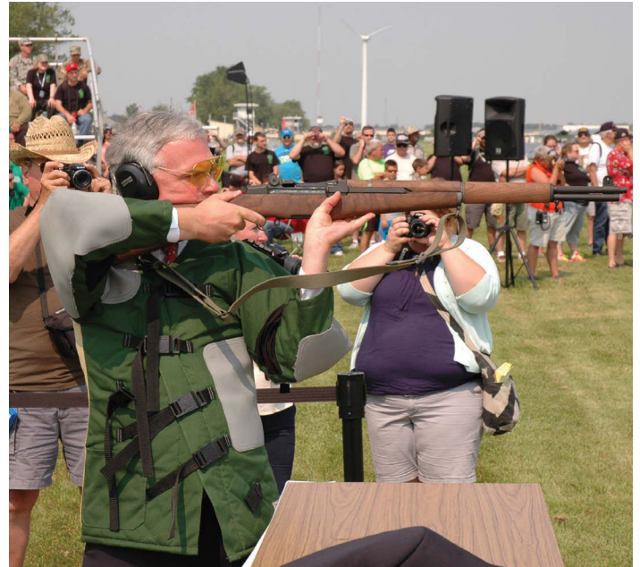
Congressman Latta fired the traditional first shot down range to officially open the National Matches.