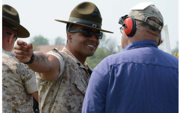
Many return to the Small Arms Firing School year after year to learn even more about the fundamentals of pistol shooting and competition.

With a few matches in the history books, there are still more to come on Sunday, July 12, as the most prestigious competitions will be fired: the President's 100, National Trophy Pistol Match and National Trophy Team Match, as well as the National Match Air Pistol.