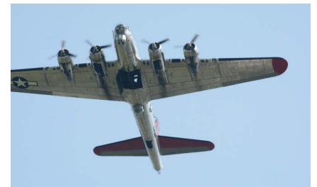
The bomb bay doors of the B-17G bomber opened above the range as large explosions on the ground simulated a successful drop.