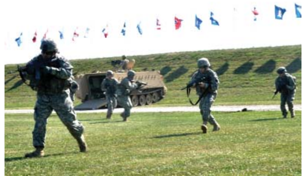
Soldiers from the Ohio Army National Guard 812th Engineers, based in Wooster, emerge from their armored personnel carrier and secure the parade ground for delivery of the American Flag during a combat demonstration.

"This is an amazing event and I'm truly proud to be a part of it," he said. "I cannot imagine how many shots I have taken in my lifetime, but I know one thing for sure, no shot ever fired will be more important than this one coming up," he said.