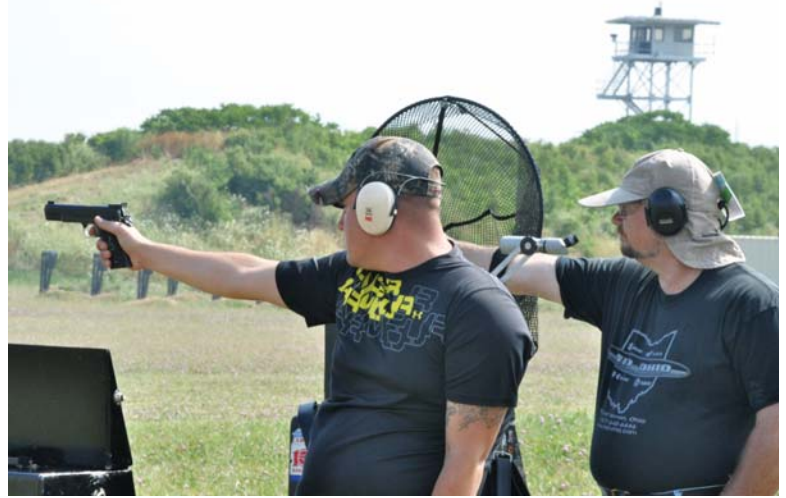
Under the oversight of the Ohio National Guard beach tower at Camp Perry, hundreds of shooters from across the nation assembled during the National Matches to discover, learn and compete.