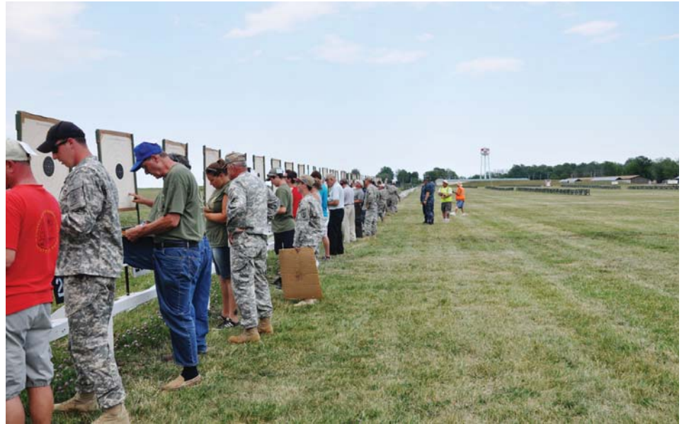
Over 400 pistol students attended the 2012 Small Arms Firing School at Camp Perry in Port Clinton, Ohio.

Rifle SAFS is a two-day program and will be conducted 28 and 29 July this year. Rifle students fire prone, sitting and standing position slow or rapid-fire exercises. On the second