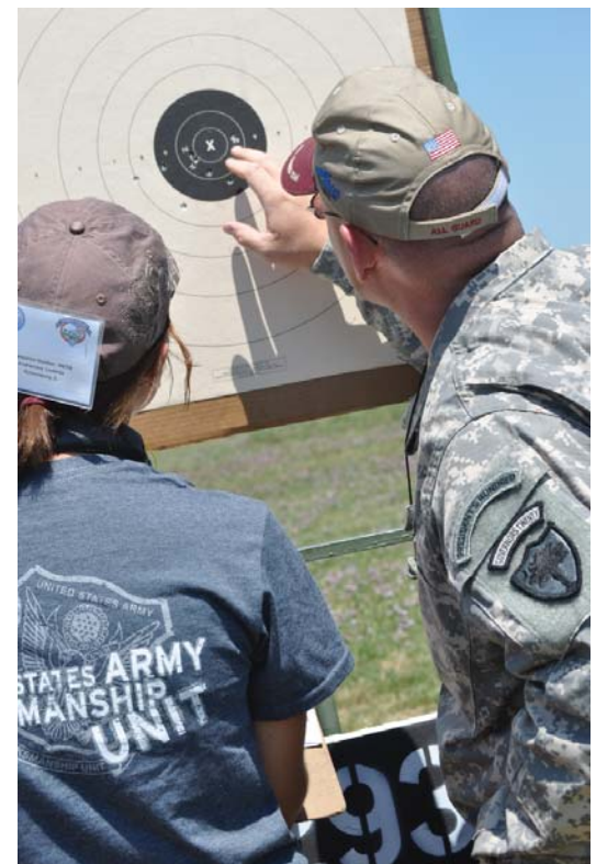
A Small Arms Firing School student receives feedback from her coach while viewing her target. The Pistol school allows students to receive hands-on instruction from the best pistol shooters in the world.