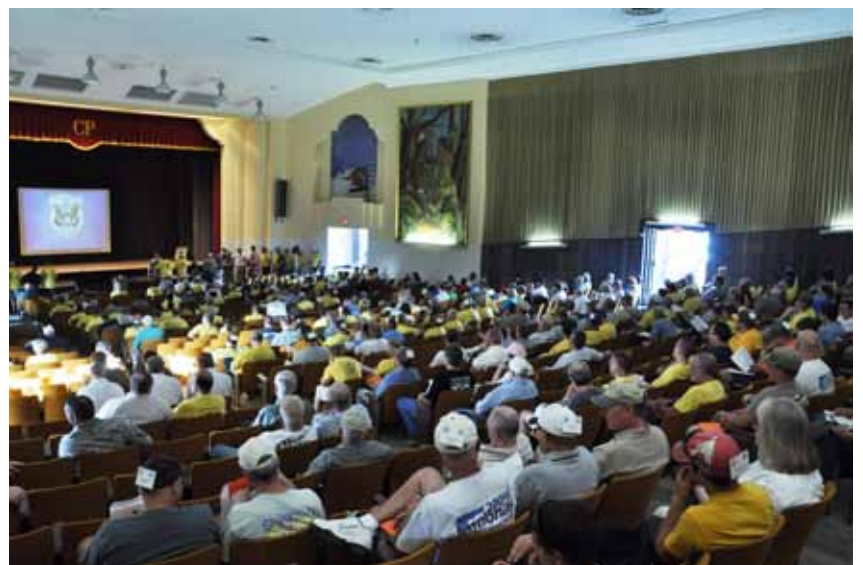
More than 380 students attended this year’s SAFS Pistol school. Here attendees await instruction at Hough Auditorium.