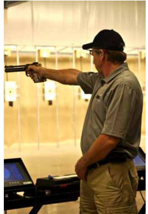
The CMP Marksmanship Centers in Anniston, Alabama, and Port Clinton, Ohio, are open for Monthly Matches and Open Public Shooting.