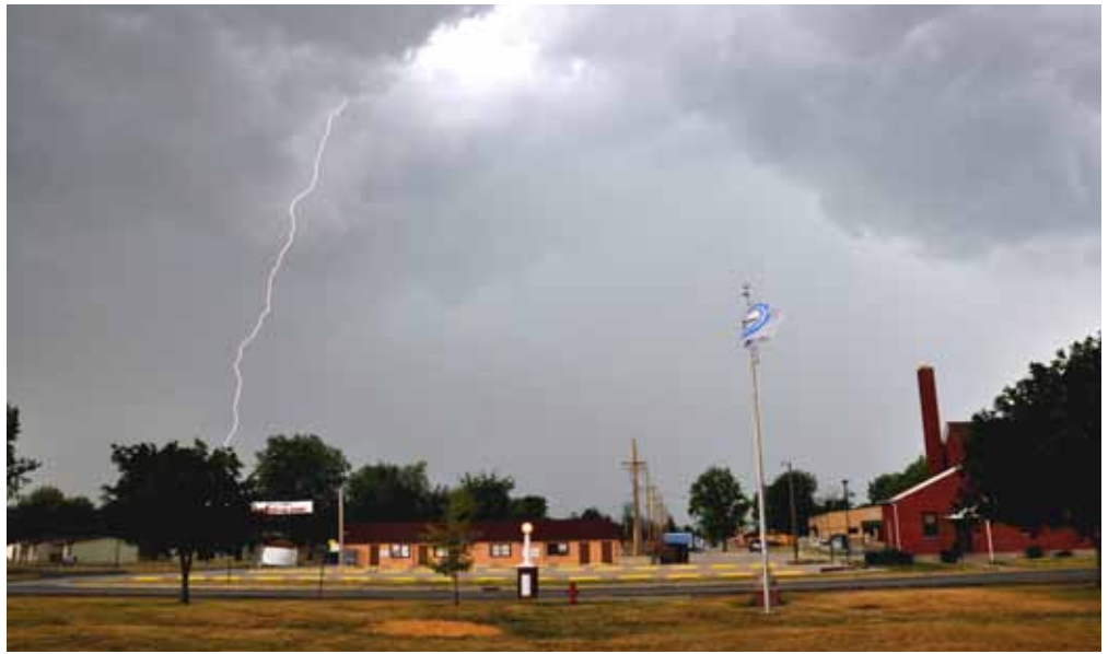
Lightning strikes are a part of life at Camp Perry in the summertime. Unfortunately, inclement weather forced the cancellation of most shooting at the 2011 Small Arms Firing School for Pistol.

As shooters returned to the range to resume firing, a second wave of thunderstorms rolled in from the west and put an end to firing for the day. The Basic class was to have fired an M9 pistol Excellence In Competition match at the conclusion their practice session.