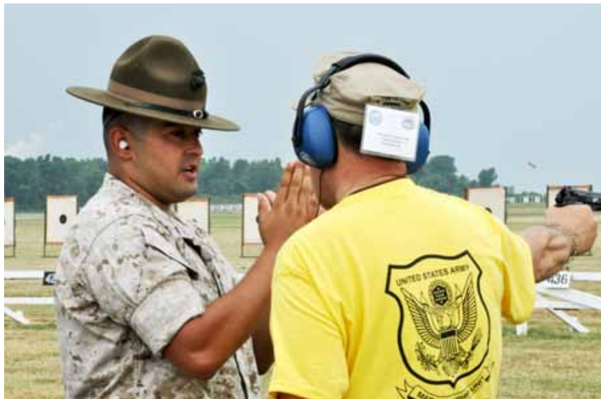
Members of every major military service pistol team assist with high-quality instruction at the SAFS Pistol school.