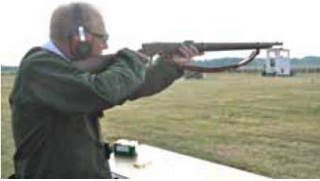
Ohio Governor Ted Strickland fired a historical Sharps-Borchardt Model 1878 single shot rifle to open the 2010 National Matches.