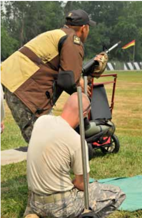
In the Hearst Doubles Team Match, team members must depend on each other for coaching as non-firing coaches are not allowed on the firing line.

Complete results for the Hearst Doubles Match can be found at, http://clubs.odcmp.com/cgi-bin/report_eventAward.cgi?matchID=5690&eventID=12&awardID=1 , and photos for the 2010 National Trophy Matches can be found at http://cmp1.zenfolio.com/ .