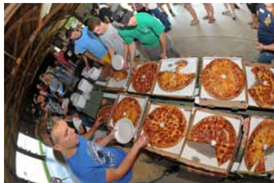
Bushmaster Firearms sponsored a pizza party at the conclusion of the CMP USMC Junior Highpower Clinic on Sunday, 1 August.