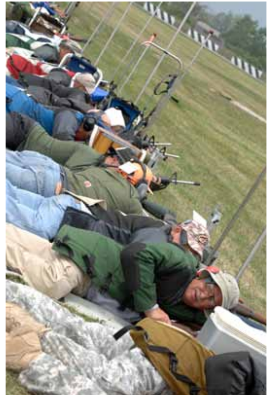
A total of 306 teams competed in the 2010 Hearst Doubles Team Match.