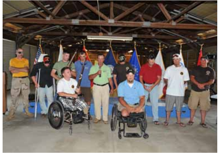
The M1 for Vets Program has presented over 227 rifles to veterans across the country. A special presentation was made during the CMP Games Festival Closing Ceremony.