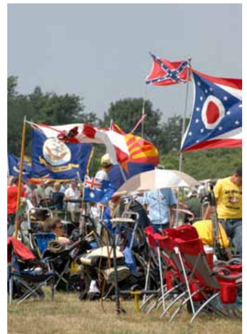
Teams displayed their flags on the firing line during the National Trophy Team Rifle Match. A total of 81 teams competed in the match.

The AMU certainly held nothing back this year and they will be carrying home the hardware to prove it. Photos from the events can be found at http://cmp1.zenfolio.com/ .