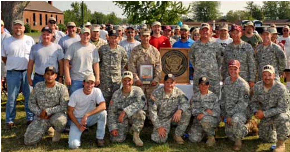
The President's Match shoot-off provides an opportunity for the match's top 20 shooters to showcase their talent in an exciting post-match final event.

For complete results of the President's Rifle Match, log onto http://clubs.odcmp.com/cgi-bin/report_matchResult.cgi?matchID=5690 .