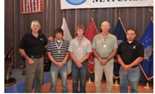
Third place Team, Missouri Shooting Sports Assoc. Gold, Presenter: GySgt R. Lee Ermye