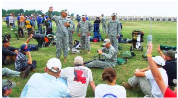
Students received nearly two hours of interactive instruction on the firing line which included dry-firing in all three shooting positions, use of the web sling and operation of the M16 service rifle.