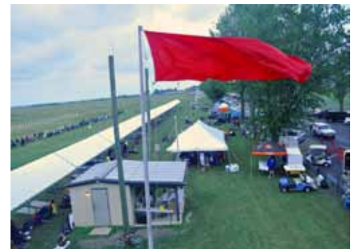
During Relay 2, north wind gusts mixed with driving rain began soaking targets and blowing them out of their frames.