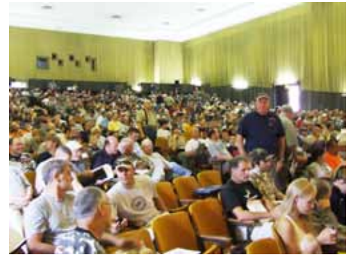
Nearly 700 participants registered for the 2010 Small Arms Firing School for rifle. Hough Auditorium was filled nearly to capacity during the USAMU’s classroom session for basic and advanced classes.

During the SAFS basic program, SFC Praslick discussed safe handling and the characteristics of the M16 service rifle, including clearing instructions and function. SPC Augustus Dunfey covered range procedures and operations, range commands and scoring.